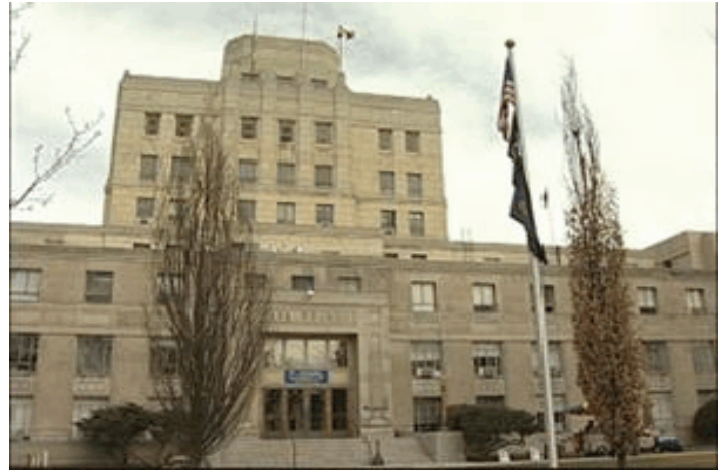
Capitol Annex: Site of 2008 - 2009 legislature

We helped to defeat a bill that would have eliminated assistance for medical treatment for adults with cystic fibrosis, and we helped to pass a resolution to continue the funding while the state reviews how the program is conducted.